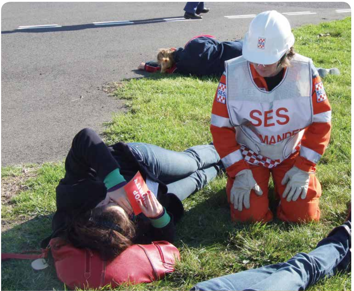
Avalon Airport training exercise